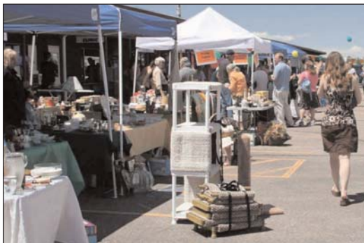
Partygoers stroll the "midway" at last year's event.

If you can't make it to Fort Collins on June 1, stop into our Loveland Cat Adoption Center for cupcakes!